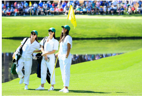
Caddie outfits, a tradition