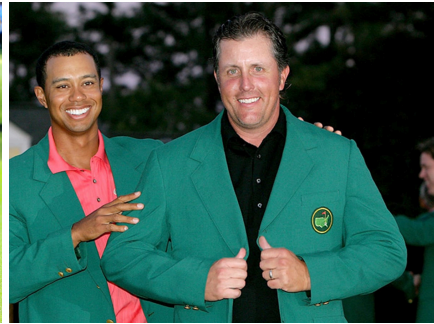
Green jackets, another tradition